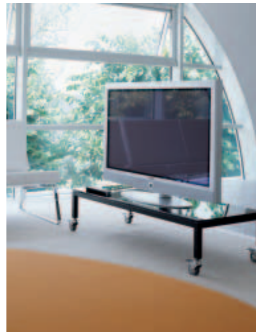
Piedistallo girevole da tavolo Rotating desktop